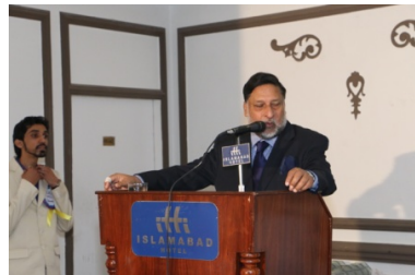
Hon`ble Chief Justice Chowhan