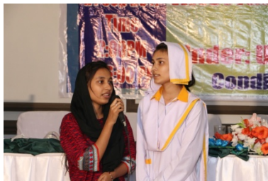
Christian Girls Presenting Peace Song