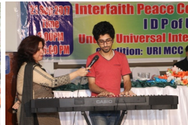
A Baha`I Boy singing Peace Poem