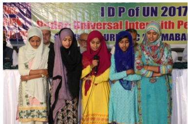
Muslim Girls reciting Na`at Shreef