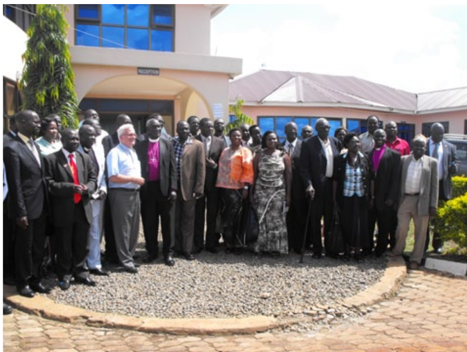
Members of Parliament with cultural, religious and community leaders during a dialogue meeting on land based conflicts in Lango Region.