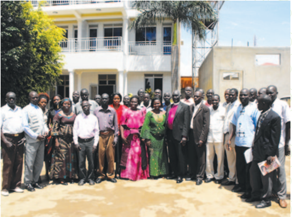
Members of Parliament with, cultural, religious and community leaders during a dialogue meeting on land based conflicts in Acholi Region.

This Resource Guide is copy righted, nevertheless, ARLPI encourages its use. However when using it, please acknowledge URI & ARLPI.