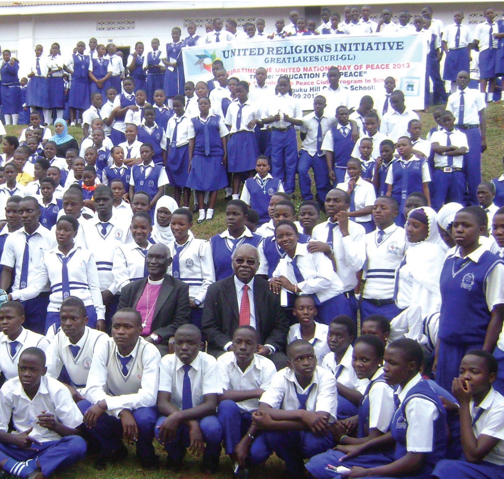
Twekolere Women's Development Association CC, along with other Great Lakes region CCs, gathered hundreds of students on International Day of Peace at Seguku Hill College in Kampala, Uganda, to launch an Interfaith Peace Clubs program in schools.

SPECIAL EDITION: INTERNATIONAL DAY OF PEACE