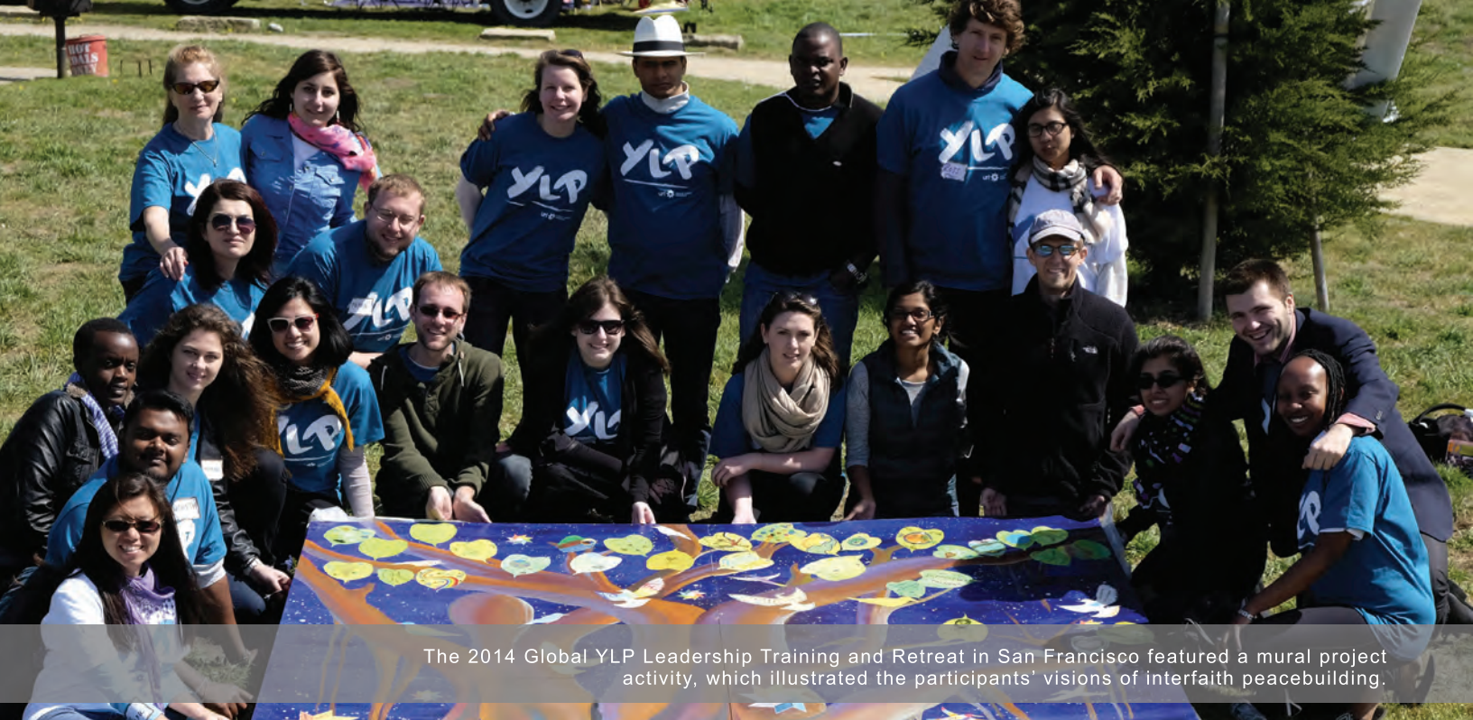
The 2014 Global YLP Leadership Training and Retreat in San Francisco featured a mural project activity, which illustrated the participants' visions of interfaith peacebuilding.