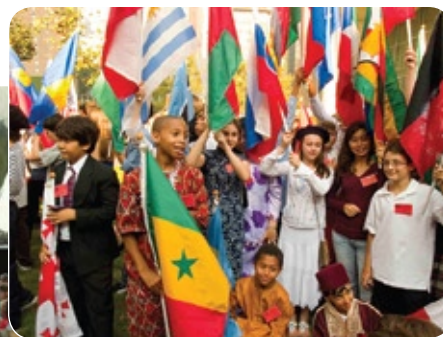
The United Nations