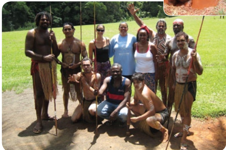
Trail of Dreams in Australia