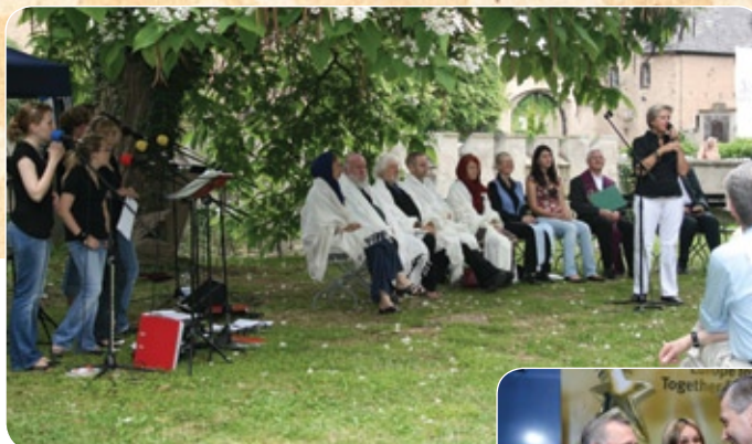
Bonn Peace Prayer