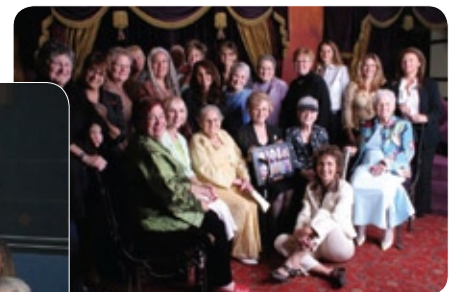
SARAH Cooperation Circle