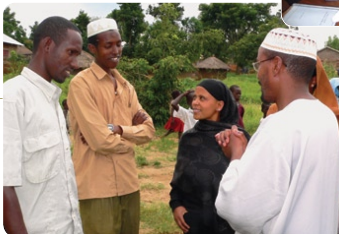
Ugandan youth meet Ethiopian youth