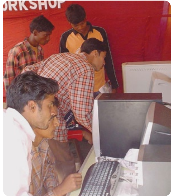
Ektaan Cooperation Circle, India