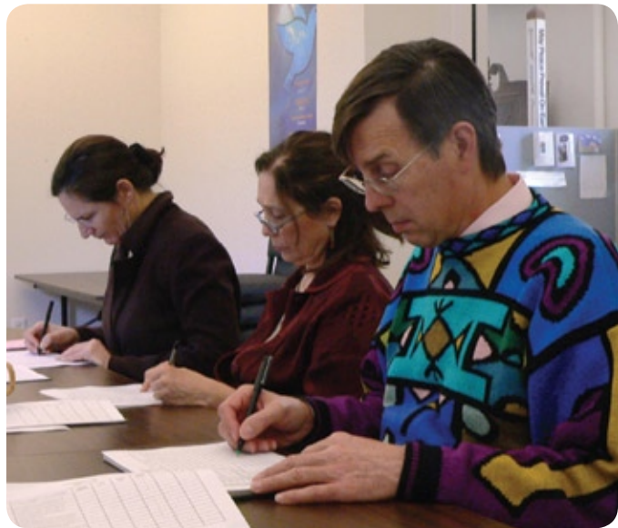
Official counting of ballots

Through URI's lengthy election process, we strengthen our ability to pioneer effective global governance and to contribute to a bold new model of global participation and leadership.