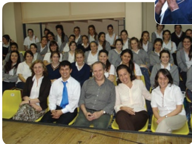
Escuela de Amor Cooperation Circle