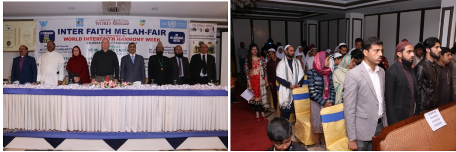
Guests respecting the Anthems of both countries Pakistan and Jordan