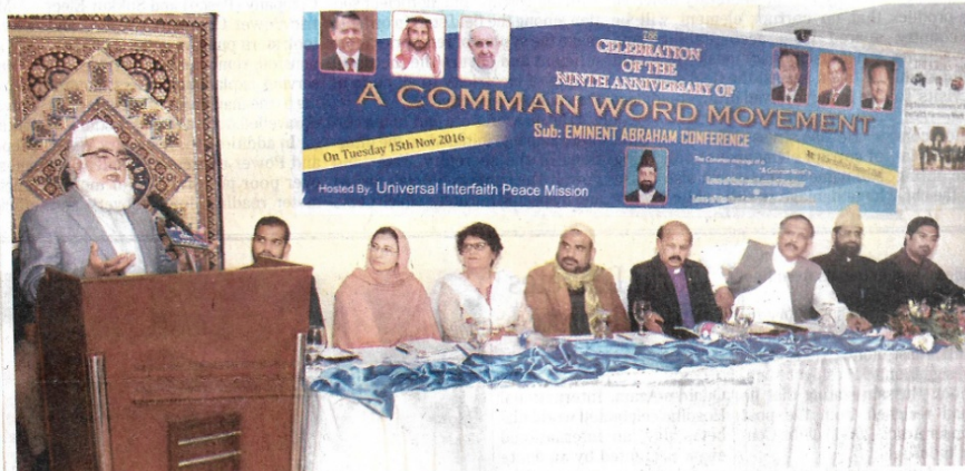
ISLAMABAD: State Minister for Religious Affairs and Interfaith Harmony Pir Aminul Hasnat Shah addressing 'Eminent Abraham Conference' organised by Universal Interfaith Peace Mission at Islamabad Hotel.

Speakers at an interfaith harmony ceremony call upon followers of different religions to respect each other's beliefs and replace hatred with love