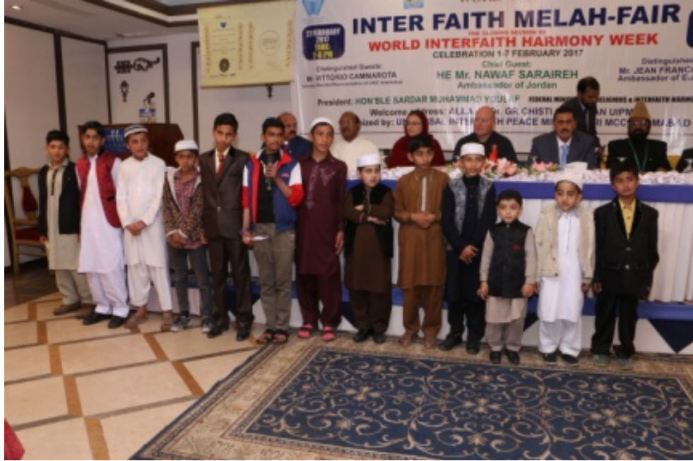
MIM School System`s boys presenting Praise to Almighty Allah and paying homagr to the Prophet (SAW)