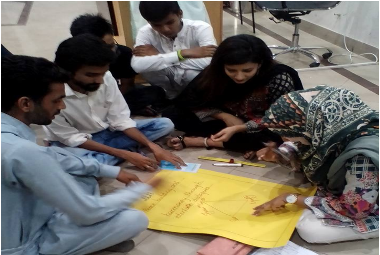
Together, interfaith youth are getting skills and knowledge about peace and interfaith harmony through exercise by listing and sharing experiences with another.