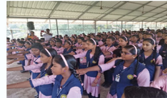
Infant Jesus Central School, Thuvayur