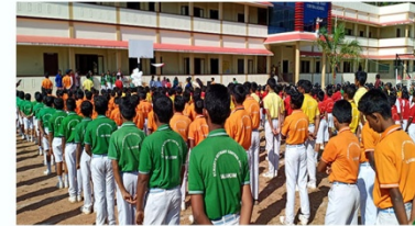
St. Mary's Bethany Central School, Valakom