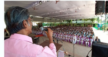
St Johns School, Anchal