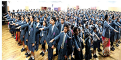
Bangalore International Academy