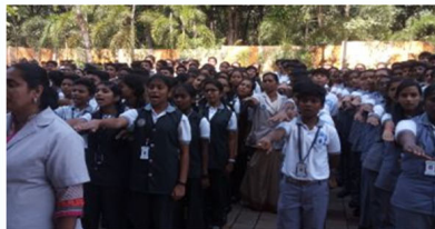
Brook International School, Sasthamcotta