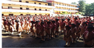
St Mary's Mulakuzha