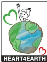
Heart4Earth Foundation India