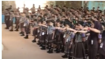
Delta Central School - Aylara