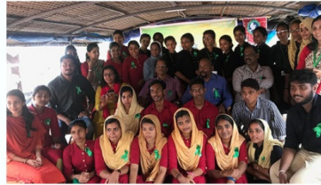
Laa De Institute of Social Sciences, Kollam