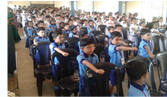
NGPM Central School, Venchempu