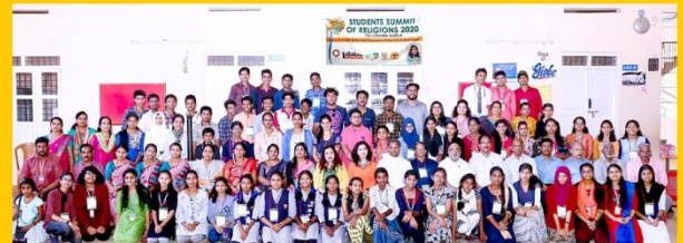
Delegates of Students Summit 2020