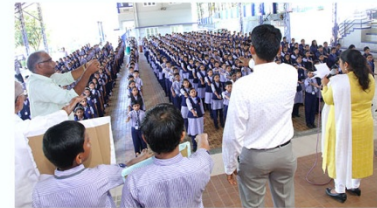
BRM Central School, Chengamanadu