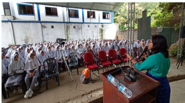
Loyal Ladies College - Kandy, Sri Lanka