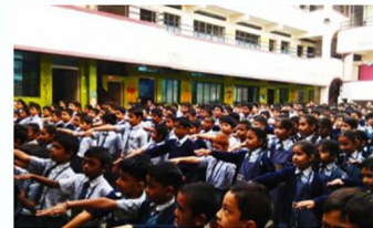
Gandhinagar Stracy Memorial High School, Bangalore