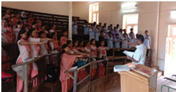
Karnataka Arts College Dharwad