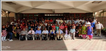
Youth Red Cross office bears, Bangalore