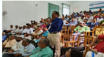
Introduction of One Billion Youth 4 Peace, National Assembly- Sri Lanka