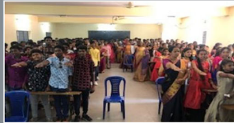
Govt. Junior college, Jayanagar, Bangalore