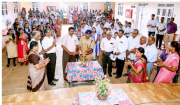
Lamp Lighting - One Billion Youth 4 Peace