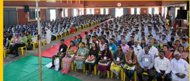
Audience of Inaugural Function