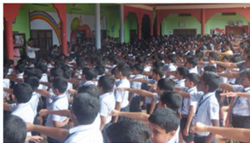
Mar Baselious Ocean Star Public School, Chirattakonam