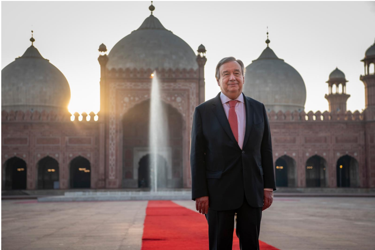
Guterres also visited the Lahore fort and Badshahi Mosque on his last day in Pakistan.

On 18 th February, 2020 UN Chief Antonio Guterres visited the Lahore and he met with students, religious leaders from different faith, and Government officials of Punjab, representative of Media and social organizations and peace promoters.