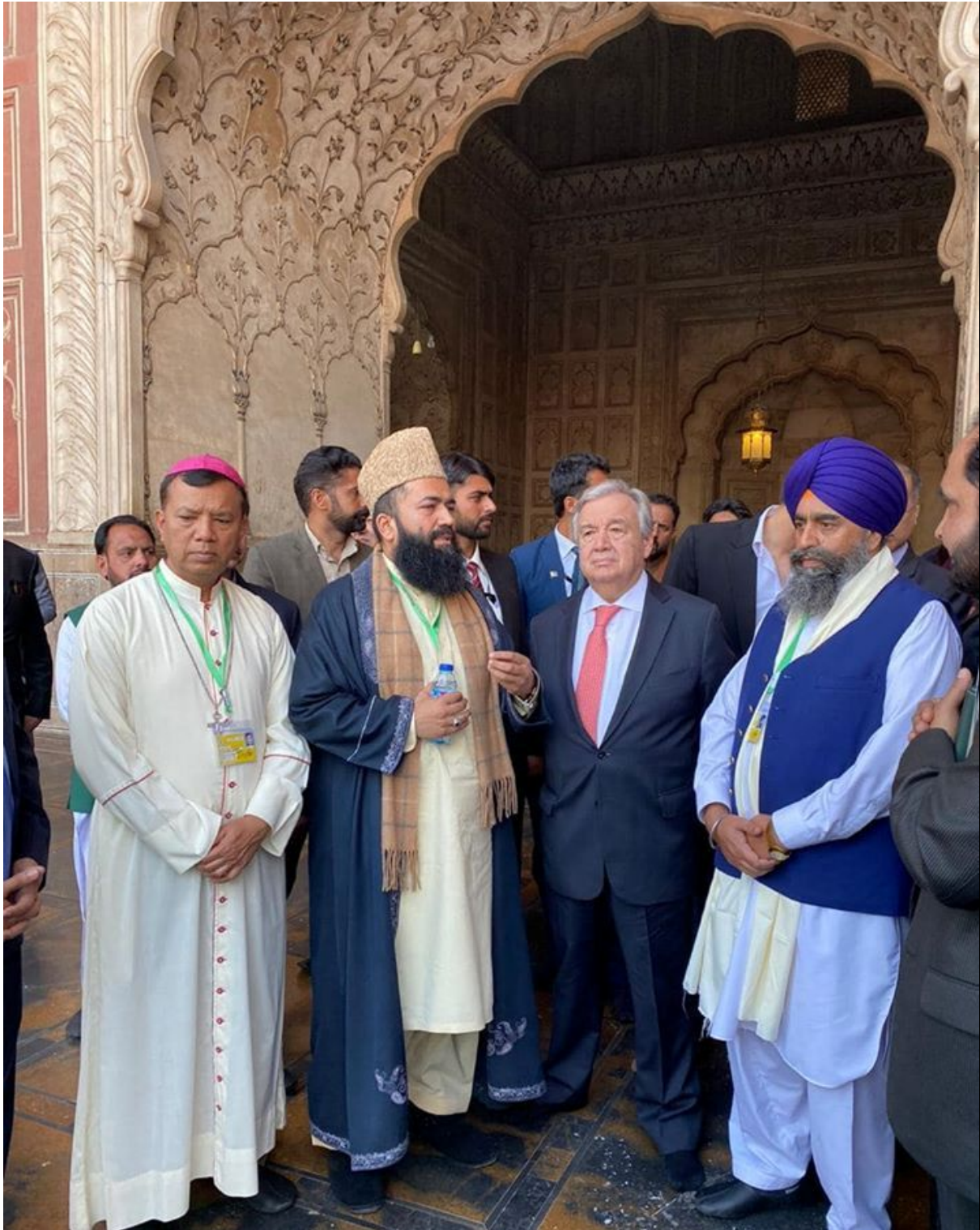
UN Secretary General Antonio Guterres sharing with Religious leaders at Royal Mosque Lahore, Pakistan

Mr Guterres called for more youth participation within political systems and international organizations saying “the presence of youth is absolutely essential in power corridors where decisions are made, policies are defined and actions are implemented.” He admitted that his generation failed to achieve the desired goals of