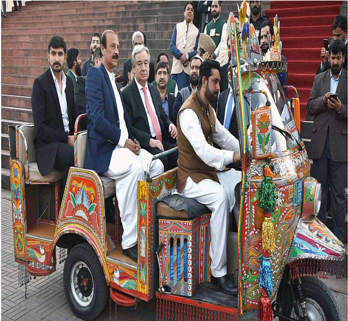
Guterres in a decked out rickshaw at the Lahore Fort.

The Chief Minister Punjab said that the arrival of Antonino Guterres in Lahore is a matter of pride and pleasure for us. He informed him about the cultural heritage of Lahore including Punjab. UN Secretary General António Guterres said that Punjab is a land rich with cultural heritage and he will not forget the traditional hospitality. On this occasion, the Chief Minister presented portrait album to António Guterres of his visit to Lahore. António Guterres expressed his pleasure while seeing the album. Usman Buzdar also presented a painting of Shahi Fort to António Guterres. Secretary General thanked the Chief Minister Punjab for his splendid hospitality in Lahore. British Parliamentarian Afzal Khan, Provincial Ministers, Chief Secretary, Inspector General Police, government officers, famous political, religious and social personalities were also present on this occasion.