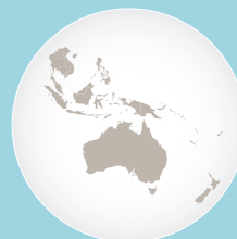
SOUTHEAST ASIA AND THE PACIFIC