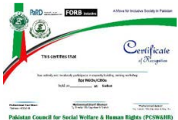
Pakistan Council for Social Welfare & Human Rights (PCSW&HR) Committed to Bring Social Changes